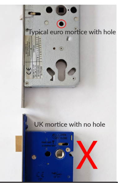
4. For the mortice to be compatible it must have a hole below the square spindle hole. This is a euro standard but some UK mortices may not have this.

6. Tape the drilling template so that the line of the latch is centred with the spindle hole. Using pins, mark the 16mm & 10mm holes.