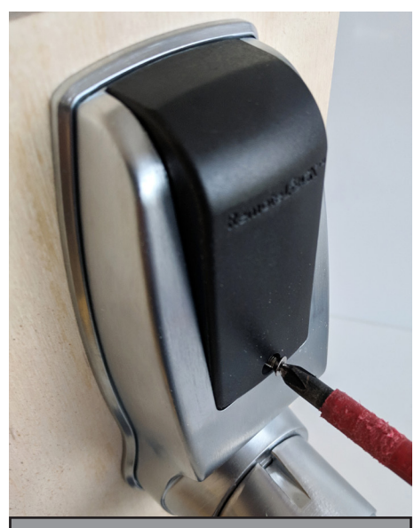
14. Finally, fix the plastic cover on using the screw.