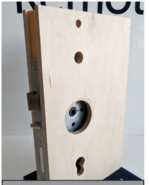
9. Fit the mortice back into the door.