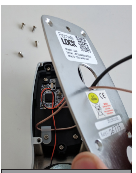
11. Re-thread both cables through the top hole and fix the backplate back using the 4 screws.