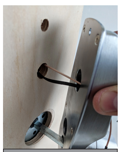
11. Offer up the battery pack enclosure, thread the two cables through the upper hole.