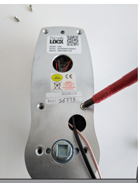
10. Remove the 4 screws from the back of the keypad.