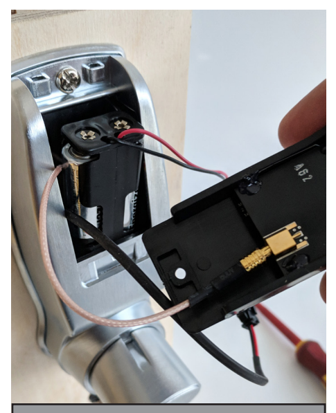
13. Connect the battery pack, the lock requires 4 x AA batteries. Plug the wifi antenna lead into the rear of the plastic cover.