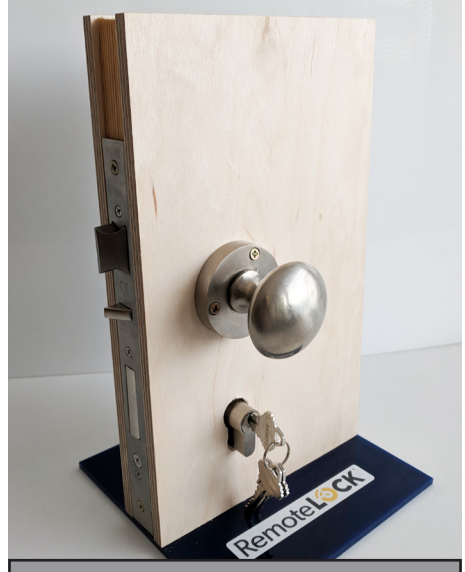
1. Remove existing knob or lever handle from the door.