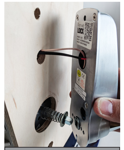
10. Insert the spindle and spring as shown, then offer up the keypad, insert the two cables through the 16mm diameter hole.